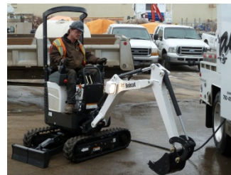
Electric Compact Excavator