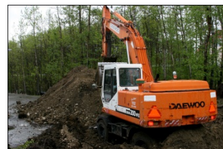
Large Area Trenching